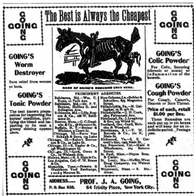
Figure A9. Best is always the cheapest. Spirit of the Times , August 25, 1900