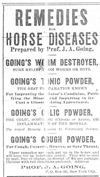
Figure A2. Remedies for Horse Diseases... Spirit of the Times , November 1, 1879