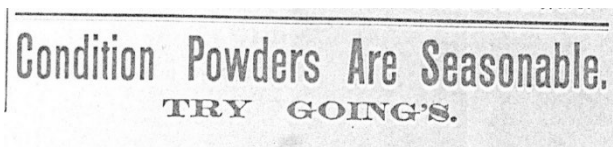
Figure A8. Condition powders are seasonal, try Going's. Spirit of the Times , May 16, 1891