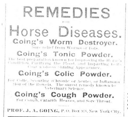
Figure A3. Remedies for horse diseases. Spirit of the Times , March 24, 1883